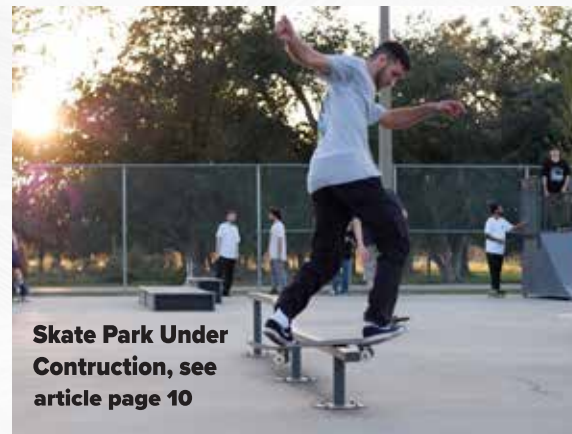
Skate Park Under Construction, see article page 10