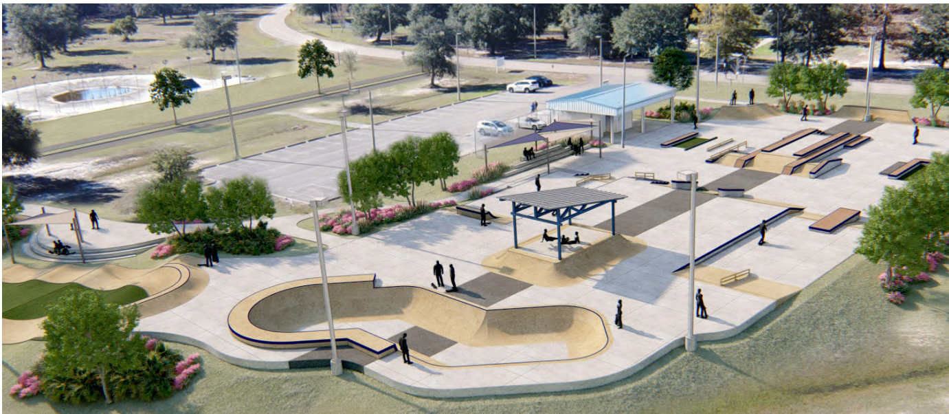
Rendering of update and expansion

The Pelican Park Pelican's Nest Skate Park is undergoing a major expansion that will include a new pump track. The new 28,000-square-foot facility promises to be a regional attraction for riders (skateboards, bikes, scooters) of all ages and skill levels, with completion slated for late 2024. It will be the second largest skate park and pump track in the state and will feature cutting edge technology and a design that will accommodate more than 100 users at any given time. The Pelican's Nest also features lights for night riding, restrooms and vending machines.