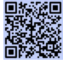
Scan QR code for Pelican Park map

Below and on the following pages you'll find a complex comparison graphic and a fact sheet on each of the Pelican Park complexes, respectively. Each fact sheet is designed to give you at-a-glance information including a brief description of the complex, quick facts including amenities, months used, estimated annual impressions, signage included with a sponsorship, and more. Each also includes at least one photo of the complex.